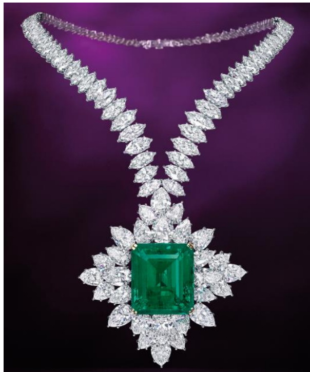
42.88-Carat Natural Colombian Muzo Emerald and Diamond Pendant Necklace, Harry Winston

Estimate : HK$ 23,000,000 – 28,000,000 / US$ 2,950,000 – 3,600,000