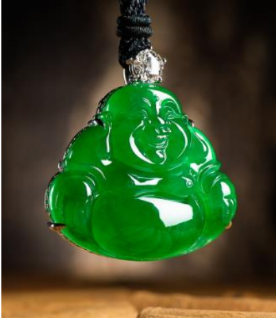
Jadeite “Laughing Buddha” and Diamond Pendant

Estimate : HK$15,000,000-20,000,000 / US$ 1,920,000-2,560,000