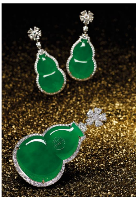
Jadeite “Gourd” and Diamond Pendant; and Pair of Matching Pendent Earrings

Estimate : HK$ 12,000,000-15,000,000 / US$ 1,540,000-1,920,000