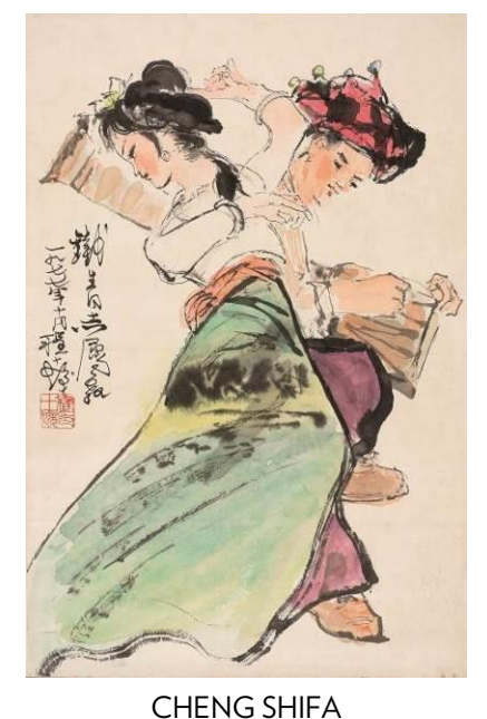
Ethnic Dance 1977 ink and colour on paper, hanging scroll 68 x 45cm (26 3/4 x 17 3/4in.) Est: HK$ 500,000 – 600,000/ US$ 65,000 – 78,000