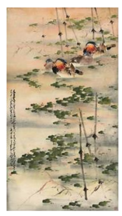
ZHAO SHAO'AN Mandarin Ducks 1980 Ink and colour on paper, framed 178 x 95cm (70 x 37 3/8in.) Est: HK$ 800,000 – 1,000,000/ US$ 103,000 – 130,000