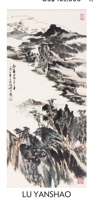
Sailing in Autumn Scenery 1980 ink and colour on paper, hanging scroll 83 x 37cm (32 5/8 x 14 1/2in.) Est. HK$ 350,000 – 400,000/ US$ 45,200 – 52,000