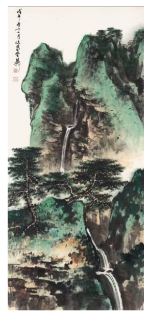
XIE ZHILIU Stream Along the Verdant Mountain 1978 ink and colour on paper, hanging scroll 135 x 60cm (53 1/8 x 23 5/8in.) Est. HK$ 680,000 – 800,000/ 88,000 – 103,000

*Estimates do not include buyer's premium Press releases and hi-res images can be downloaded via: <a href="ftp://ftp.tianchengauction.com/PR%20General/Autumn%202013/MCA&FCP">ftp://ftp.tianchengauction.com/PR%20General/Autumn%202013/MCA&FCP</a>