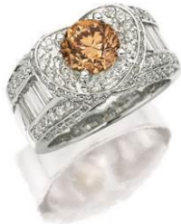
1.50 Carats Natural Brown Diamond and Diamond Ring Est. HK$ 25,000–36,000 / US$ 3,300–4,600

Tiancheng International is pleased to offer a dazzling array of 60+ 'no-reserve' lots this autumn, spanning from fine icy, green and red jadeite, exquisite coloured gemstones to diamonds and splendid jadeite Chinese chess set – we make refined jewellery more affordable than ever.