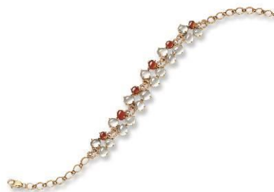
Natural Icy Jadeite, Red Jadeite And Diamond Ring And Matching Bracelet Est. HK$ 40,000–60,000 / US$ 5,200–7,800

*Estimates do not include buyer's premium