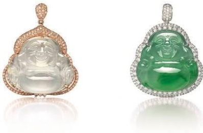
Two Natural Jadeite 'Buddha' and Diamond Pendants Est. HK$ 100,000–150,000 / US$ 13,000–19,500