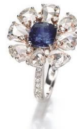
1.85 Carats Natural Unheated Sapphire And Diamond Ring Est. HK$ 30,000–45,000 / US$ 3,900–5,900