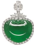
Natural Jadeite 'Ruyi' and Diamond Pendant Est. HK$ 120,000–180,000 / US$ 15,500–23,500