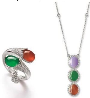
Natural Jadeite and Diamond Pendant Necklace and Ring Est. HK$ 80,000–120,000 / US$ 10,500–15,500