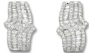
Diamond Ear Clips Est. HK$ 25,000–35,000 / US$ 3,300–4,500